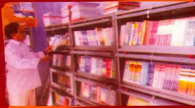
Visiting team of the NCTE Inspecting College Library