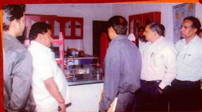
Visiting team of the NCTE Inspecting Science Lab