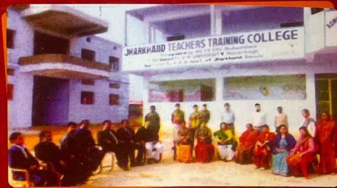
Photo Session of the Staffs