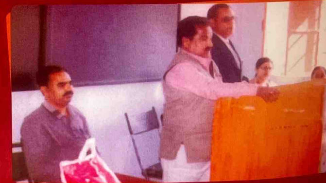
Secretary addressing in the hall